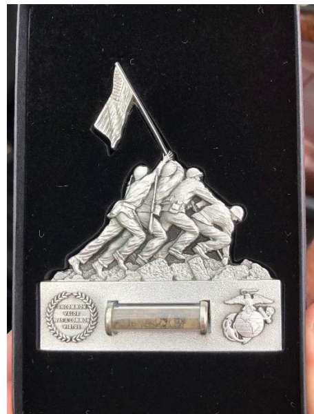
Desk plate with vile of sand from Iwo Jima – one of the gifts to Ray from MGM Det 1180