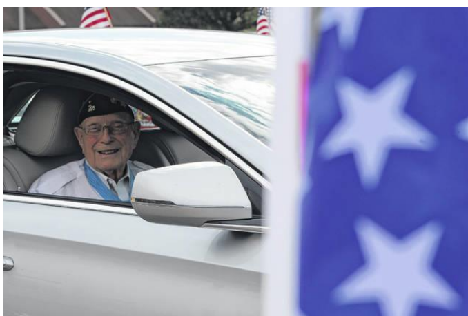
Hershel Woody Williams, pictured, is the last surviving Medal of Honor recipient of the Battle of Iwo Jima. He visited Point Pleasant on Friday to honor a fellow Marine.