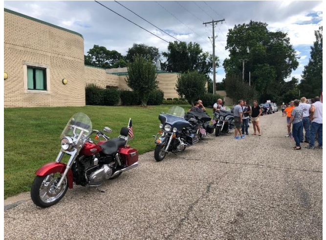
Legion Riders Motorcycle Club, Pt Pleasant