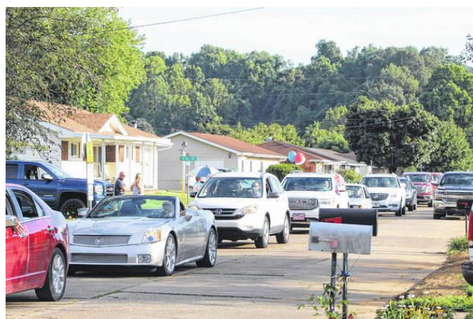
Parade participants fill Birch Avenue in Point Pleasant, honoring 100-year old veteran Ray Stith.